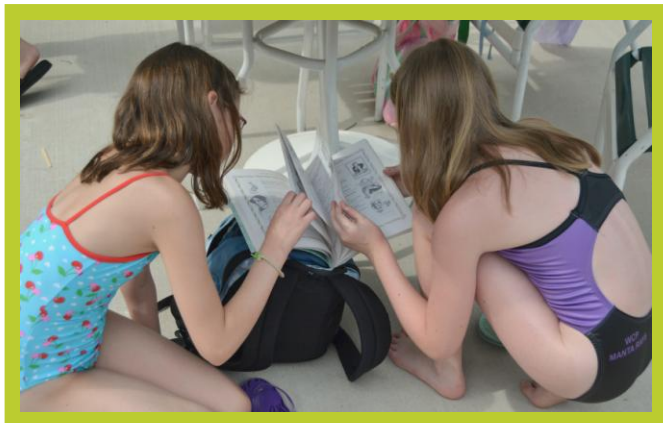
WCP is a great place to hang out with friends.