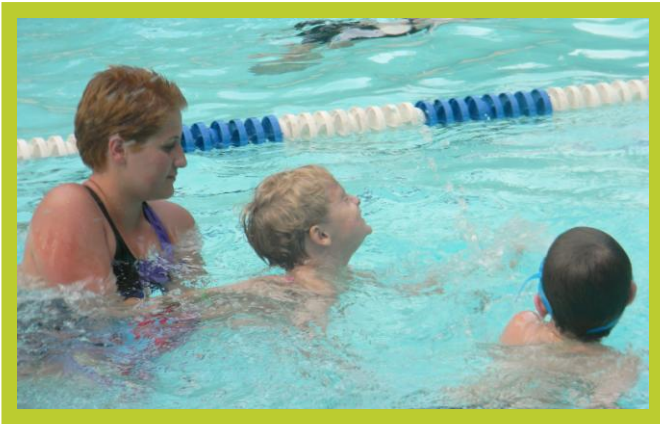
Learning to swim!